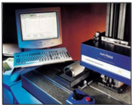
From Talysurf Series